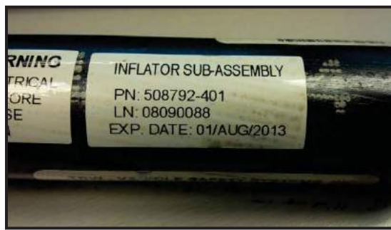
Figure 1. Sample Label showing expiration date