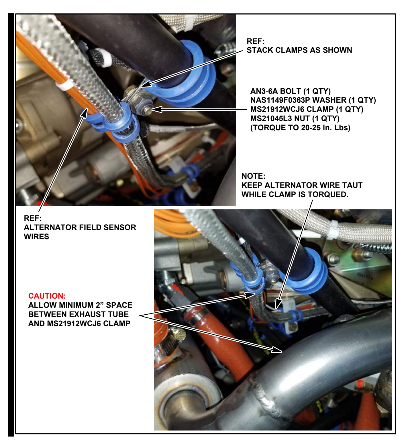
Figure SB M20-340-3 - NEW ALTERNATOR WIRE MOUNTING